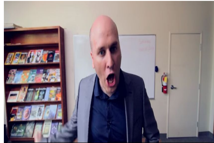
Camera: Medium close up, central framing Action: As teacher shouts GO!