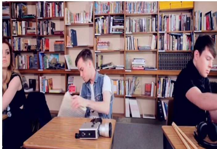
Camera: Tracks left to right. Rule of thirds considered Action: As band looks up