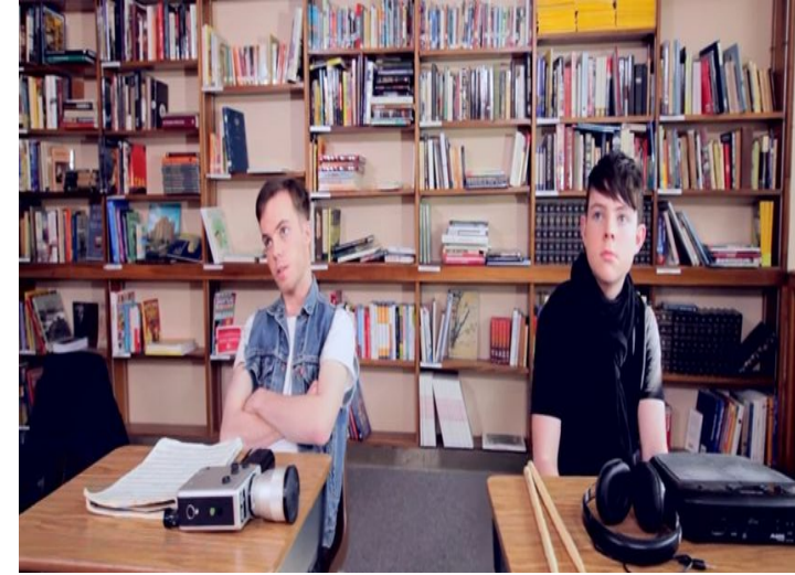
Camera: Tracks right to left Action: Band watch teacher enter