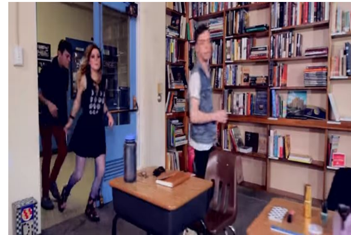
Camera: Tracks the band, left to right Action: As the band enter the classroom