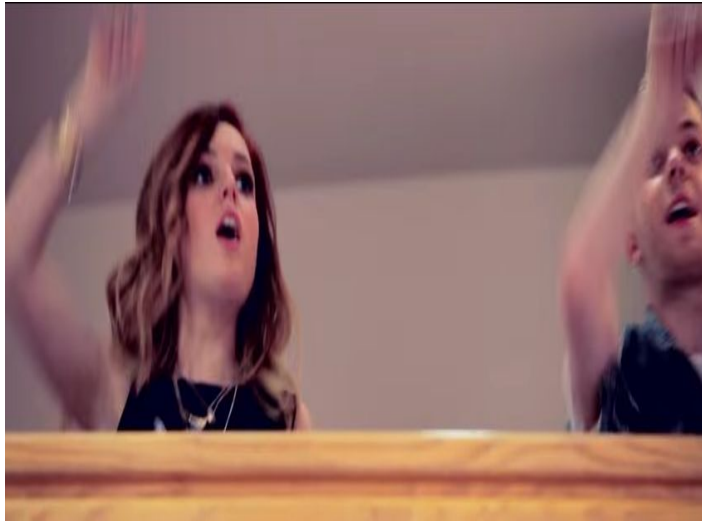
Camera: Low angle, Medium close up. Action: Band continues to dance,