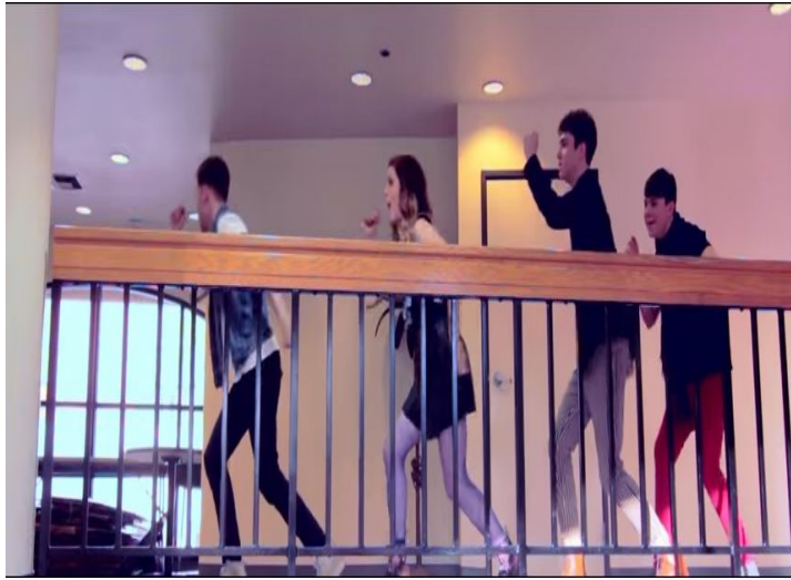
Camera: Long shot, Steady Action: Band dances on balcony. Cuts to others playing