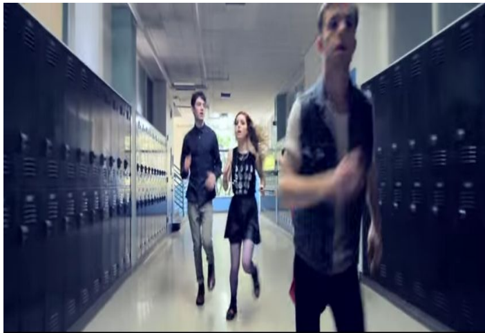
Camera: Dolly back, band always in centre of frame Action: Band runs down the corridor. The same shot is then repeated with the teacher walking down the corridor