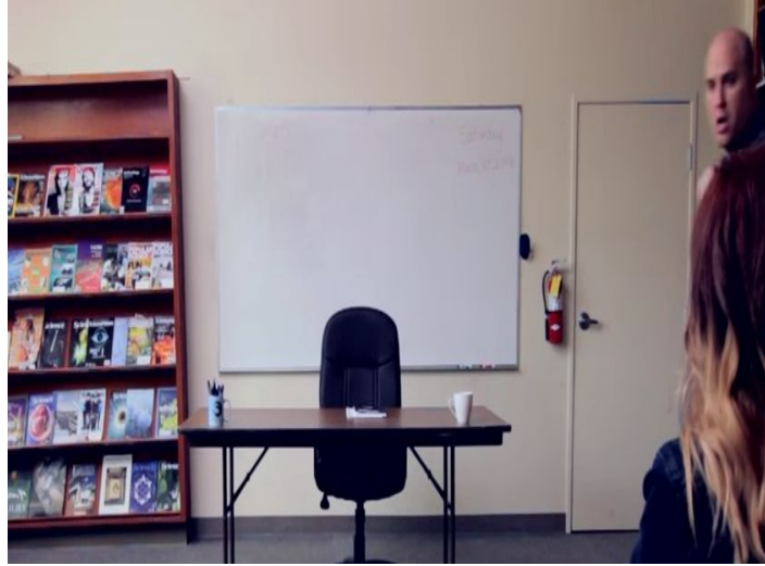
Camera: Steady, right framing Action: Just as teacher enters shot from the right.