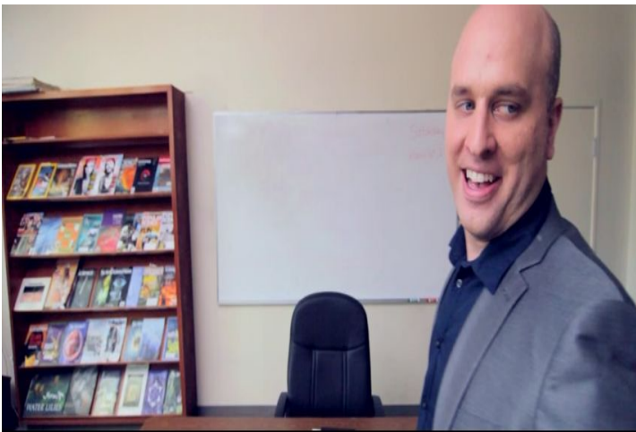
Camera: Close up of previous shot of teacher Action: He walks further into frame. Looks 'smug' at class