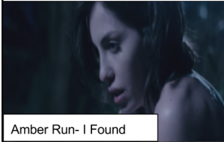
Amber Run- I Found

Themes: Another conventional aspect of this music video which we felt the need to incorporate in our product, is the concept of 'misery'. We believed that having a strong emotion demonstrated throughout the video, would allow us to make our product a lot more appropriate for the stated genre. However, we perhaps conflicted this element. The video 'I found' seemingly used low-key lighting throughout their video, however the majority of our narrative shots were high-key lighting perhaps going against this traditional convention.