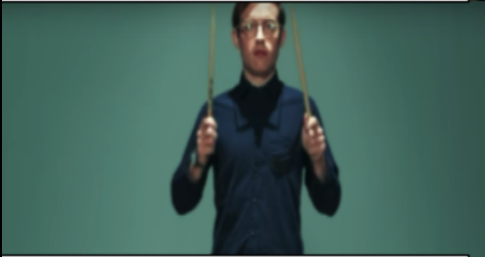
Bombay Bicycle Club- Carry Me