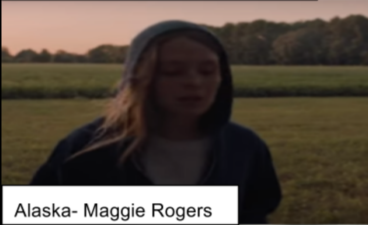
Alaska- Maggie Rogers