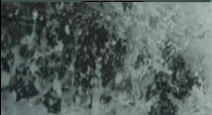
Amber Run- I Found