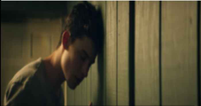
Shawn Mendes- Treat You Better