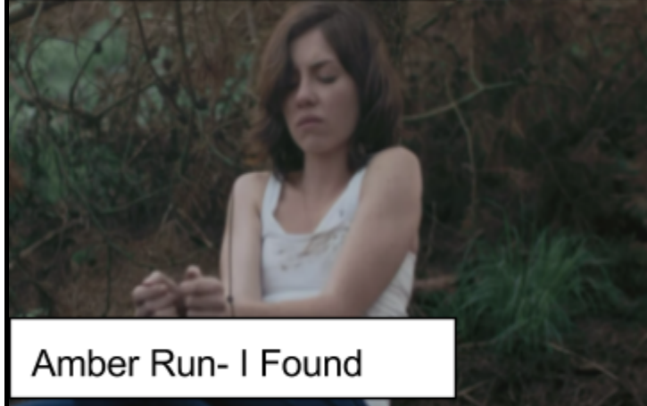
Amber Run- I Found

Themes: Another conventional aspect of this music video which we felt the need to incorporate in our product, is the concept of 'misery'. We believed that having a strong emotion demonstrated throughout the video, would allow us to make our product a lot more appropriate for the stated genre. However, we perhaps conflicted this element. The video 'I found' seemingly used low-key lighting throughout their video, however the majority of our narrative shots were high-key lighting perhaps going against this traditional convention.