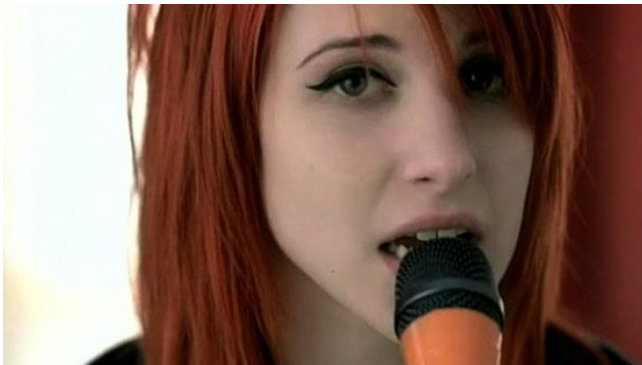
Paramore - 'That's what you get'

Star Image - After watching some of Paramore's music video we decided that the star image of our lead performer was the most important as it was with them. We noticed that the performer broke the 4th wall and sang to the camera, we replicated this in our music video as it invites the audience in and represents the performer as present. Her costume, makeup and hair were vital for the representation as we noticed stars of alternative Rock music videos usually have an edgy and quirky representation through the mise-en-scene. We have used bold eyeliner as Hayley but have added in dark red lipstick and dipdyed hair. We did this as we made red a recurring colour across our products.