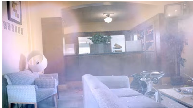
Paramore - 'Monster'

Location - When we researched the Alternative Rock genre we noticed the locations are usually abstract and obscure. An example of this can be seen on the right in an abandoned hospital. We took influence from this by setting it in a old unused barn. This also helped to represent the star as edgy and it fit with the generic conventions. The wooden beams and fence in the background are reflective of the themes of being trapped and are a nod to the name of the song: Fences.