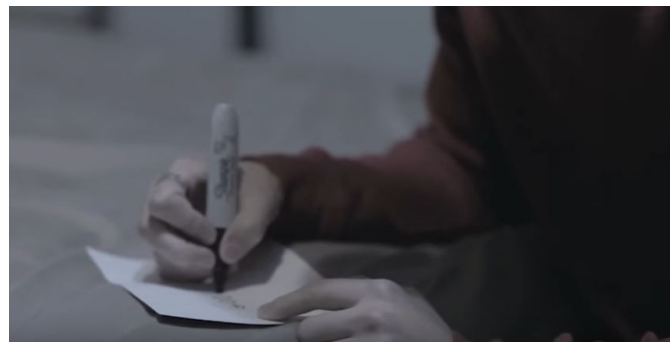
Paramore - 'When It Rains'

Narrative - Our narrative features a flashback which is unconventional of the genre. We developed this so that at the end to show the image of her as the puppet and then the pearls dropping again to signify that she is broken inside the puppet. This is a non-linear narrative, this is unconventional and we were influenced to try this because of the narrative for the music video 'When It Rains' which involves flashbacks to reveal the themes showing the bullying that lead to his suicide attempt. Our narrative duplicated this with a slow reveal starting with close ups until the audience see the full picture, this is to show that the media dresses her up like this.