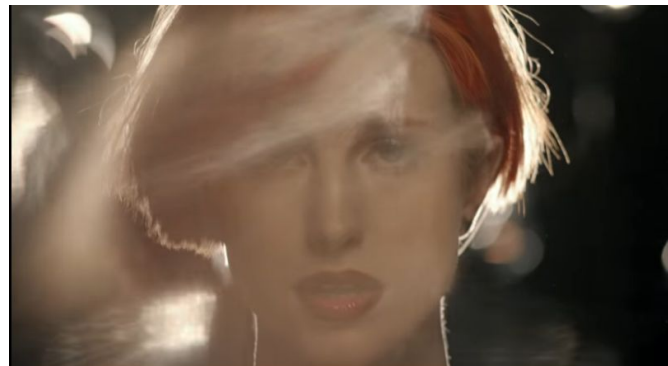
Zedd - 'Stay The Night' ft. Hayley Williams

Lighting - The repertoire of elements for the Alternative Rock genre is low key lighting. We have duplicated this in the narrative of our music video, the star is depicted with a black background and only her and the string can be seen this is similar to the shot to the left. This symbolised her isolation, as well as representing her as extraordinary and important. We decided to contrast this by using lighting flares at certain points in the video this created the effect of camera flashes reflecting the fact that this is the misrepresentation created by the media. These camera flashes only come when she is struggling