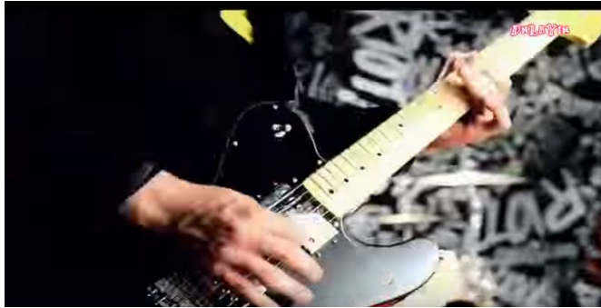
Paramore - 'Misery Business'

Mise-en-scene - We cut to close ups of the instruments used as the guitar and drums are frequent images in music videos of the genre. Another conventional feature we noticed was the use of symbolic codes through the props. We used the pearls as a symbolic code, they represent the fake image the media has created of her. When she breaks them off at the end it symbolises her breaking through the fake image the media created of her. This is similar to the dead flowers in the hospital in Paramore's 'Monster' which represent the death of a loved one.