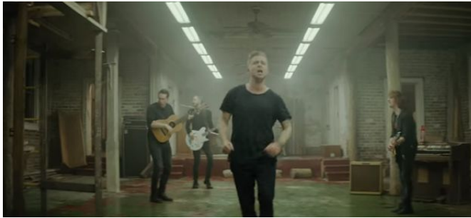
OneRepublic - 'Counting Stars'

Camera - A conventional shot used in alternative rock is a wide angle long shot of all the band members playing together. We used a similar shot to this in order to create a predictable pleasure for the audience. However, the star is usually in the foreground with shallow focus. Whereas we decided to challenge this as we wanted to clearly show the genre of music by using deep focus in the long shots of the whole band and instruments.