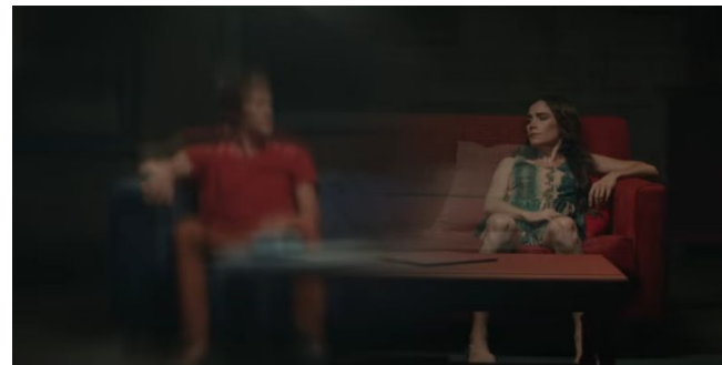
Zedd - 'Stay The Night' ft. Hayley Williams

Colour - We decided on using red tinted colour correction and red props to symbolise her passion and anger at the misrepresentation. We did this after seeing the way colours were used for symbolism in Zedd's music video for 'Stay the night', with the red and blue representing two sides of the relationship. We made sure that red was used in both the narrative and the performance in order to have continuity.