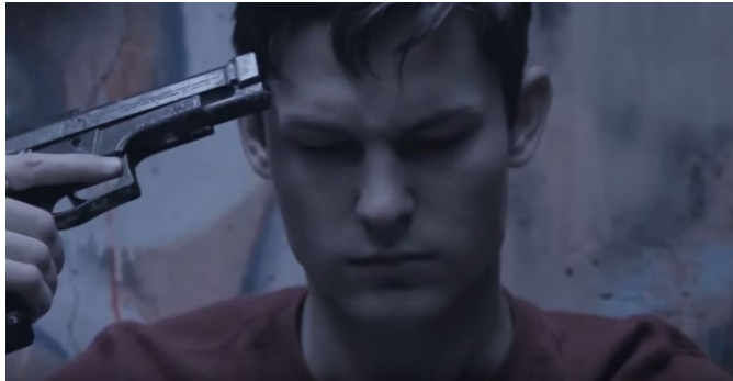
Paramore - 'When It Rains'

Themes - After watching Paramore's music video for 'When It Rains' we realised that it was important for there to be a message behind the music video. Where the theme here is of teen suicide, we decided to replicate this with our themes would be of media manipulation and encouragement to be yourself. We revealed our themes through a slow dressup of the puppet and the star attempting to break out of this false image. The idea of slowly revealing the narrative themes was influenced by the reveal of the theme in the 'When It Rains' as it isn't fully revealed until the final shot (shown right).