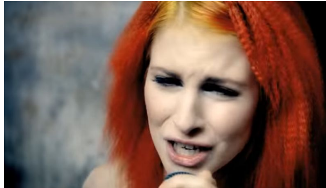
Paramore - 'Monster'

symbolising the media's obsession of reporting on the negative moments in celebrities lives. The lighting is used in 'Stay the Night' in a thematic way as the spotlights represent the spotlights on the broken relationship.